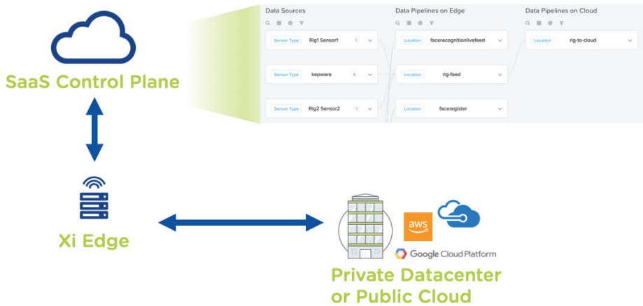
Figure: Deploy edge resources with ease

The Xi Edge platform provides secure access to IoT data sources with data pipelines all the way from the edge to the cloud, including AWS, Azure, GCP, and managed/on-prem private clouds. It also provides seamless data mobility between edge and cloud, which lets users send metadata and build ML models in the cloud.