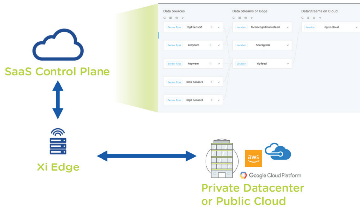
Figure: Deploy edge resources with ease

The Xi Edge platform provides secure access to IoT data sources with data pipelines all the way from the edge to the cloud. The platform allows use of public clouds including AWS, GCP, and managed/on-prem private clouds, and allows seamless data mobility between edge and cloud, to send metadata and build ML models in the cloud. Now developers can utilize edge PaaS frameworks to create building blocks to be leveraged across applications.