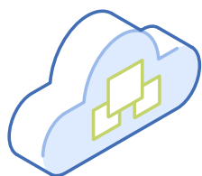
Cloud Native Integration

Nutanix makes modernizing existing applications with cloud-native functionality seamless. For public cloud deployment, Nutanix Clusters provide native networking integration allowing easy access to public cloud services, such as Elastic Block Storage (EBS), Simple Storage Service (S3), Cloudfront as a CDN and more. In addition you can choose to use cloud services to add cloud-based AI/ML automation capabilities to enhance existing applications.