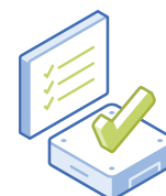
SecOps and Compliance