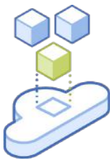
On Demand Elasticity

Extend resources from Private to Public Clouds in Minutes